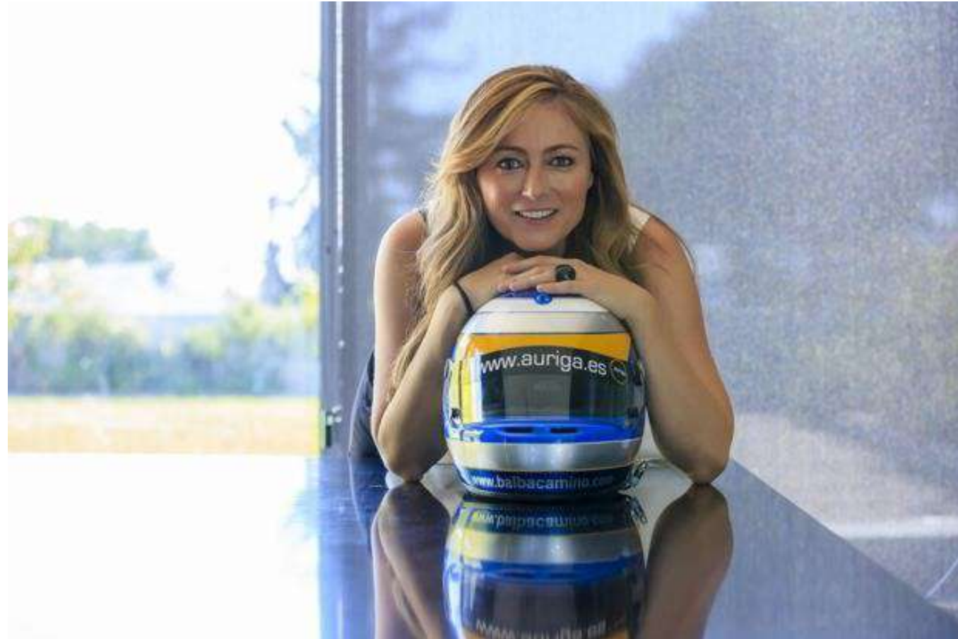
Balba Camino Pilot